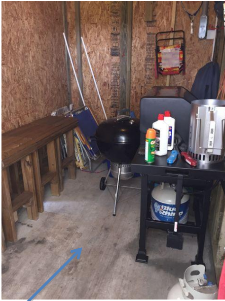
Renter's lockable storage with gas and charcoal grills