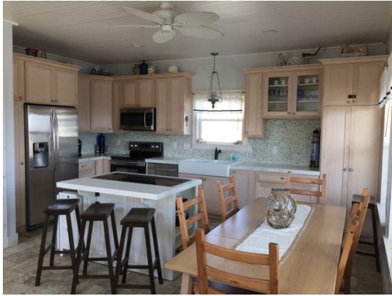
Blender, Crockpot etc.