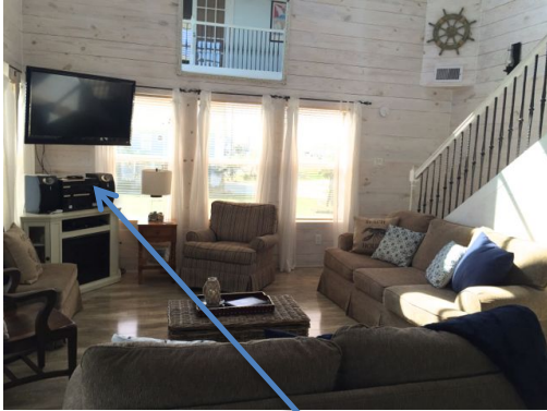
Queen Sleeper Sofa