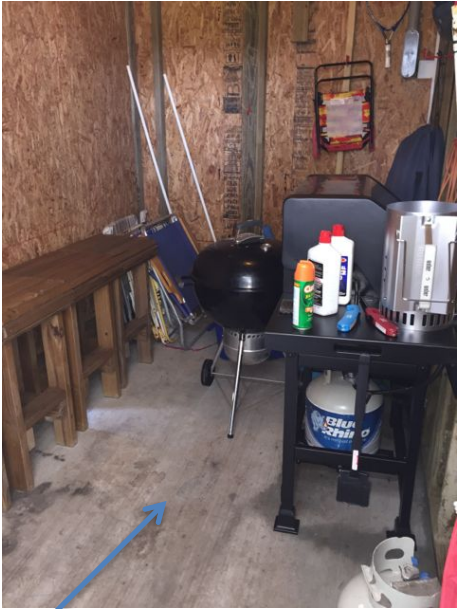
Renter's lockable storage with gas and charcoal grills